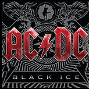
AC/DC - BLACK ICE