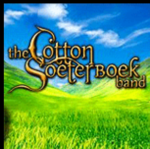
Cotton Soeterboek Band - TWISTED