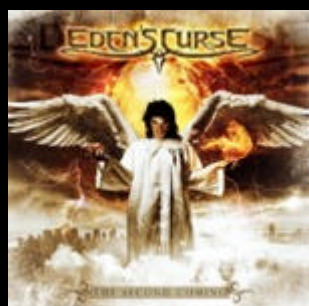
Eden's Curse - SECOND COMING