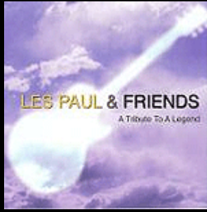
Les Paul & Friends - TRIBUTE TO A LEGEND