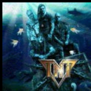
TNT - ATLANTIS