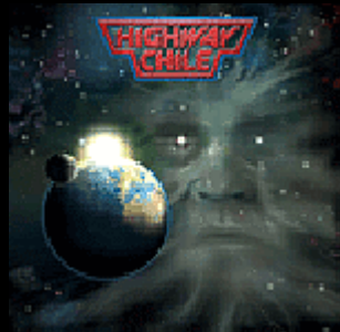
Highway Chile - KEEPER OF THE EARTH