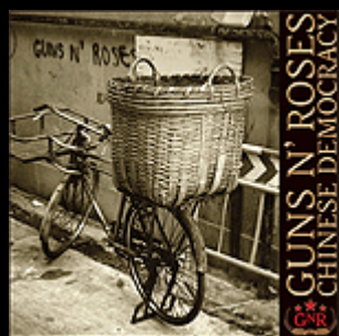
Guns N' Roses - CHINESE DEMOCRACY