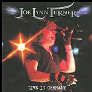
Joe Lynn Turner - LIVE IN GERMANY