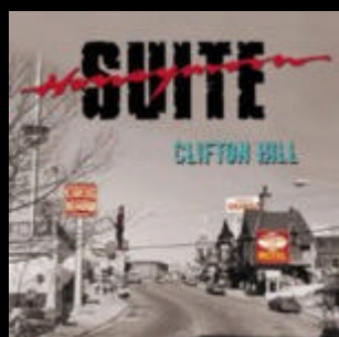
Honeymoon Suite - CLIFTON HILL