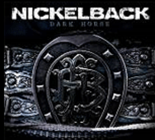
Nickelback - DARK HORSE