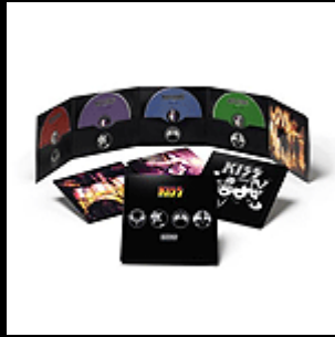
Kiss - IKONS