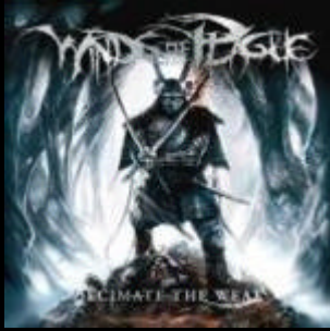
Winds of Plague - DECIMATE THE WEAK