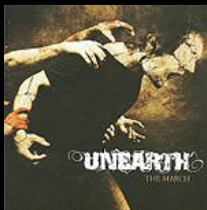
Unearth - MARCH