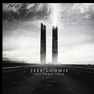
Jeff Loomis - ZERO ORDER PHASE