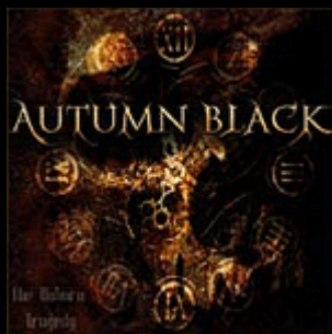
Autumn Black - THE UNBORN TRAGEDY