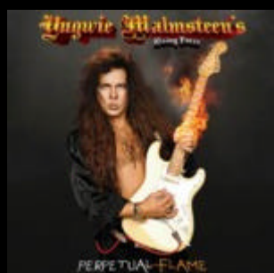
Yngwie Malmsteen's Rising Force - PERPETUAL FLAME