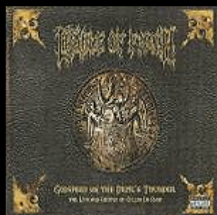
Cradle Of Filth - GODSPEED ON THE DEVIL'S THUNDER