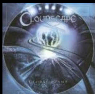
Cloudscape - GLOBAL DRAMA