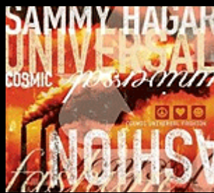
Sammy Hagar - COSMIC UNIVERSAL FASHION