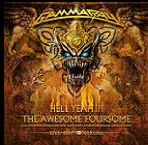
Gamma Ray - HELL YEAH! THE AWESOME FOURSOME LIVE