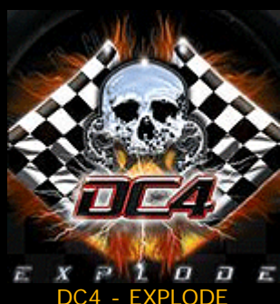
DC4 - EXPLODE