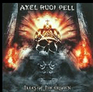
Axel Rudi Pell - TALES OF THE CROWN