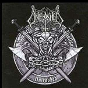
Unleashed - HAMMER BATTALION