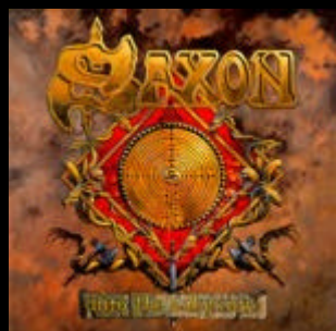
Saxon - INTO THE LABYRINTH